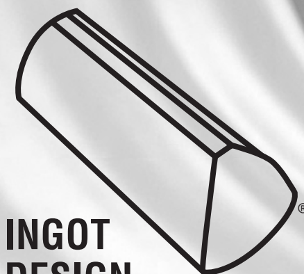
INGOT DESIGN BRIQUET

A SUSTAINED RELEASE PRODUCT TO PREVENT ADULT MOSQUITO EMERGENCE (INCLUDING THOSE WHICH MAY TRANSMIT WEST NILE VIRUS)